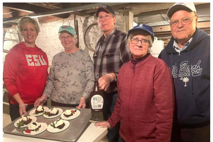
It was a big job to prepare the food in the Methodist Church kitchen and then transport it down the alley and across the lawn to the Cochran-Anspach House but the Grange is pleased to have been a part of this community effort. Thanks to all who helped.