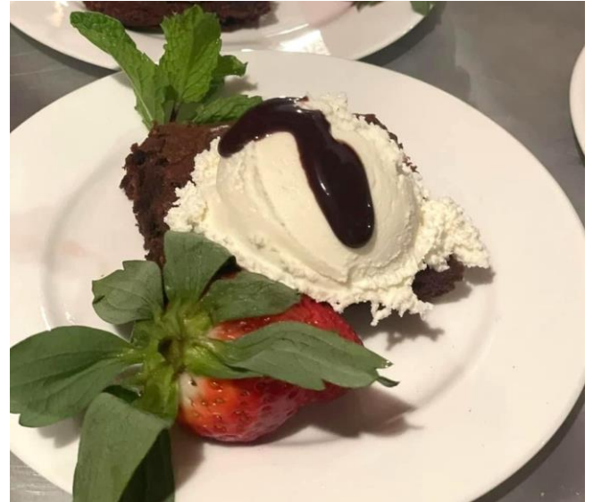
Some of the beautiful food we prepared...