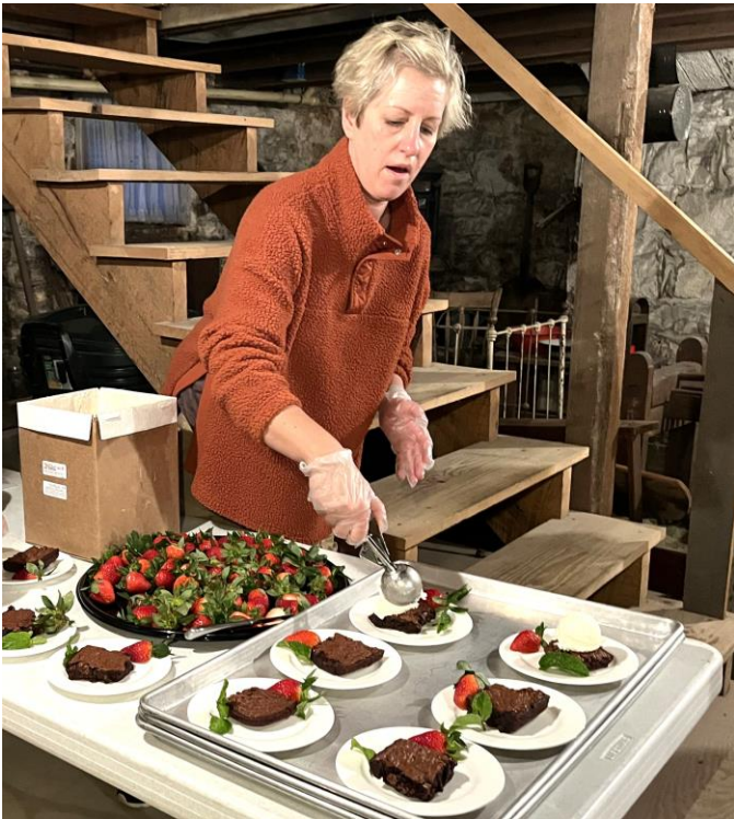
Many volunteers from the community and the Historical Society were a tremendous help to the Grange preparing and serving the food.