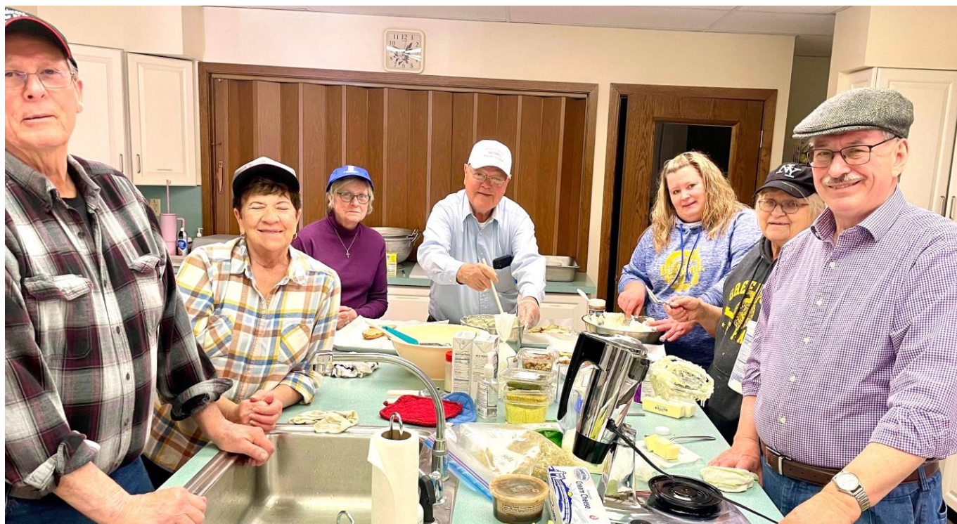
Part of the Grange Crew for the Historical Society Benefit, Feb. 16-17